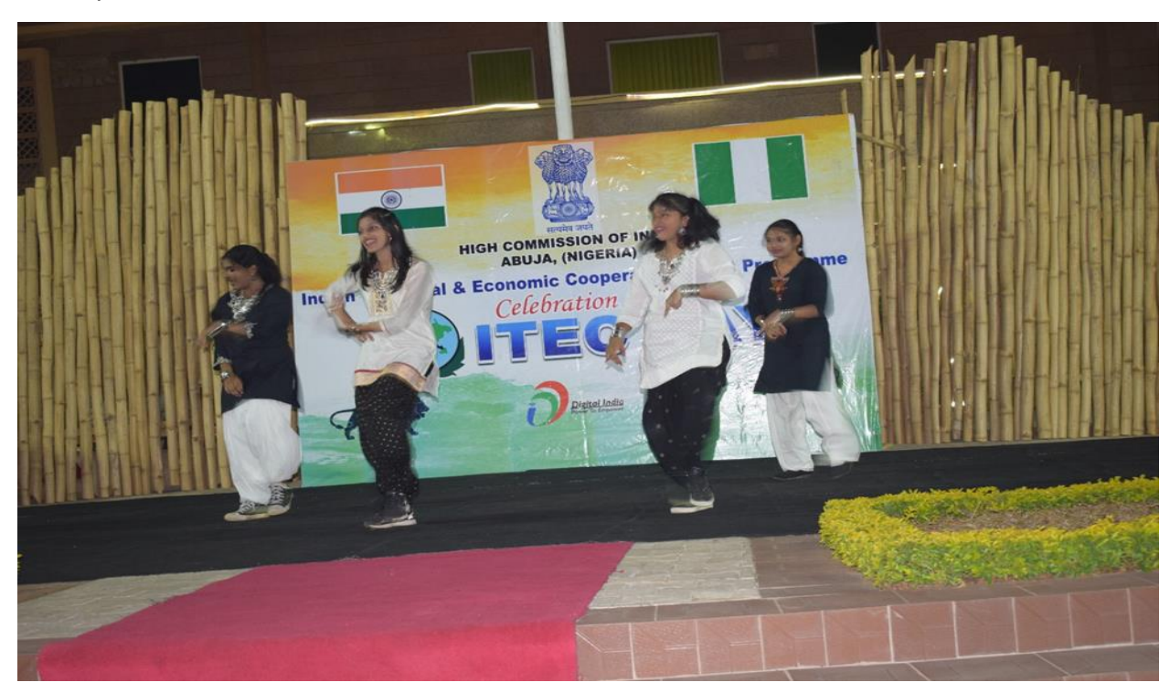
Children from the Indian Community in Abuja performing dance during the cultural segment of ITEC Day celebrations.