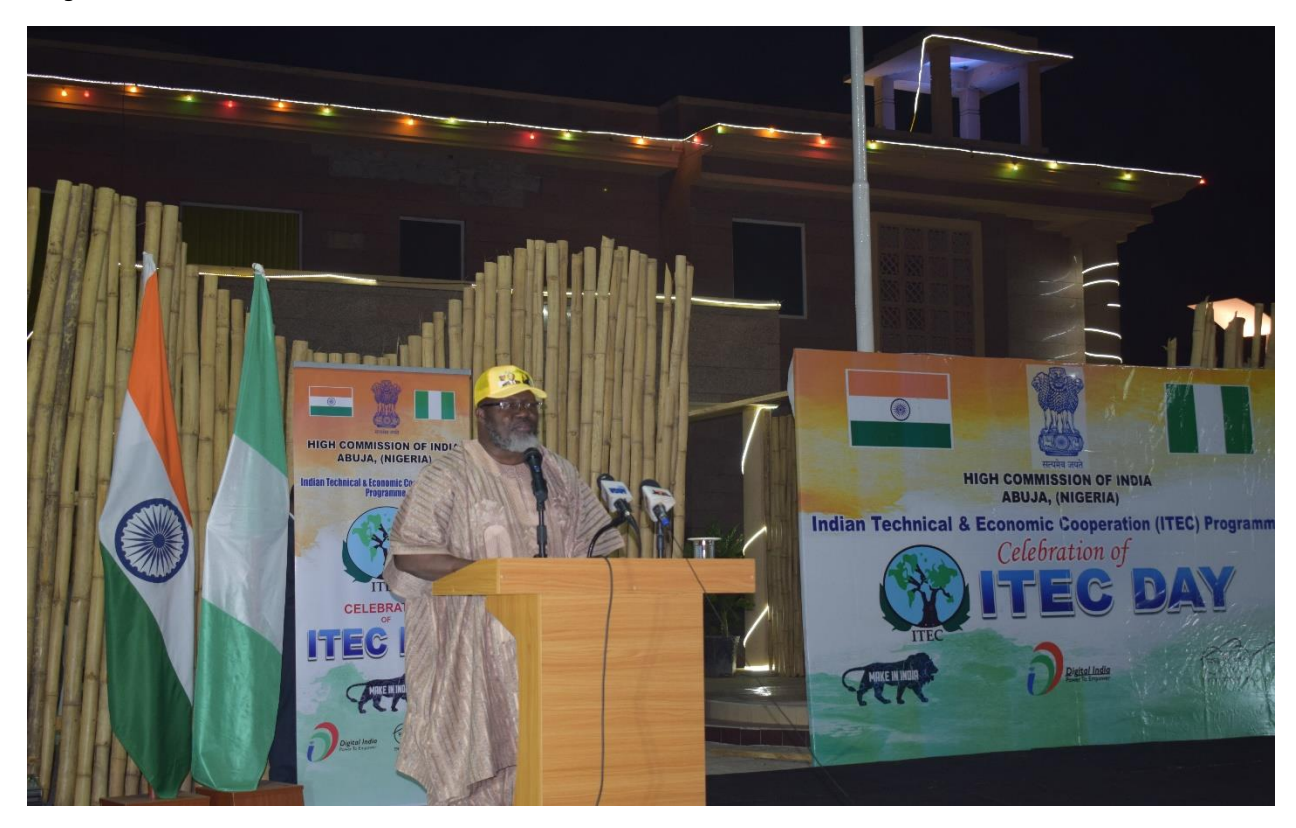
Hon'ble Minister for Communications of Nigeria, H.E. Dr. Adebayo Shittu, praising the capacity building efforts of the Indian Government through Lines of Credit and fully funded training programmes.