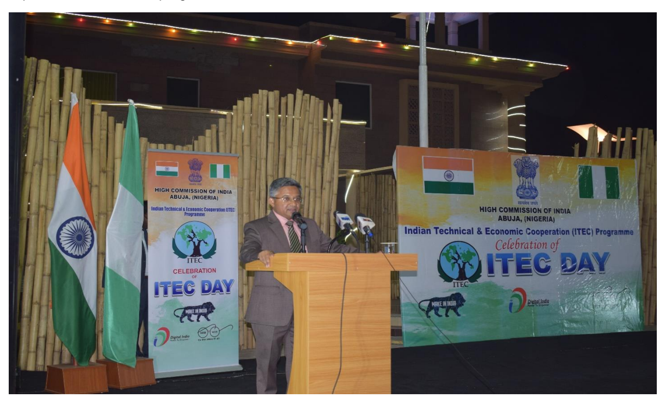
Shri Abhay Thakur, High Commissioner of India to Nigeria speaking about the capacity building efforts of the Government of India