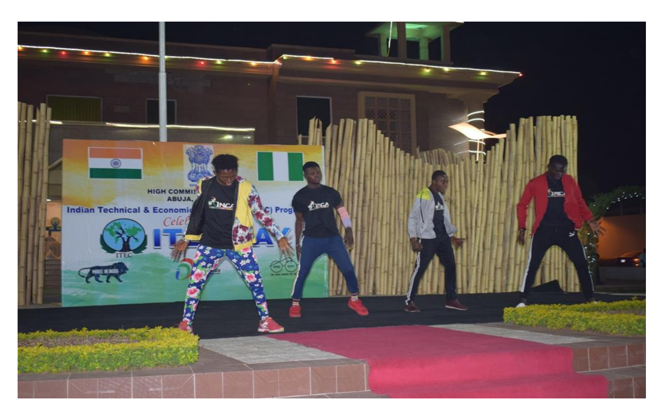
Nigerian dance group from kano performing during the cultural segment of ITEC day celebrations.